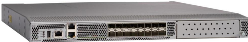
Figure 2 Cisco MDS 9132T 32-Gbps 16-Port fibre channel port expansion module